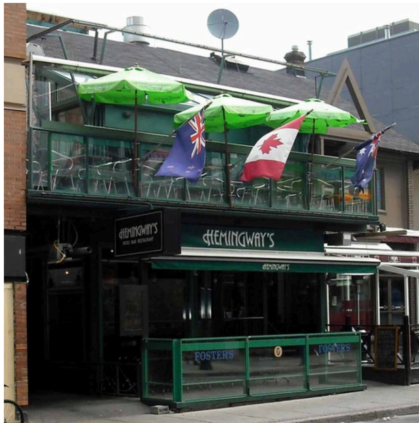
Hemmingway's 142 Cumberland St