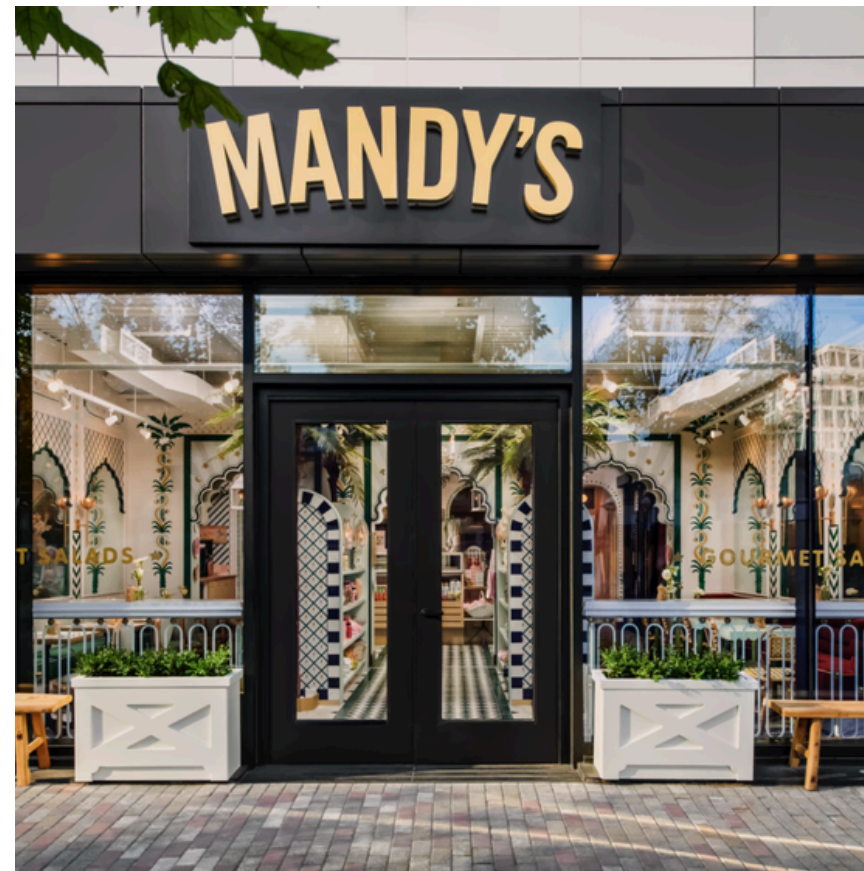
Mandy's 110 Bloor St W