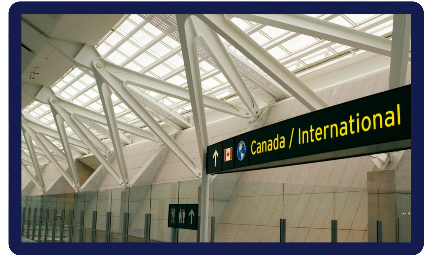
TORONTO PEARSON INTERNATIONAL AIRPORT (YYZ)