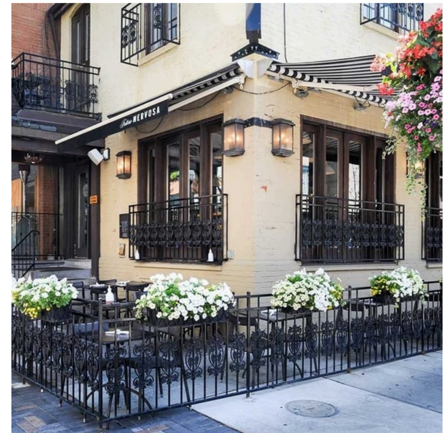
Trattoria Nervosa 75 Yorkville Ave