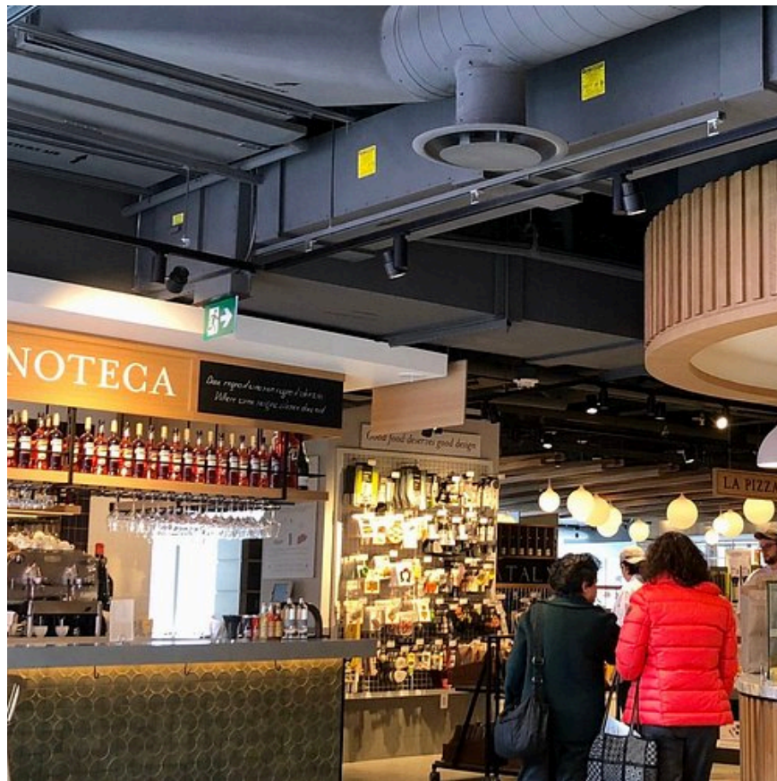
Eataly 55 Bloor St W