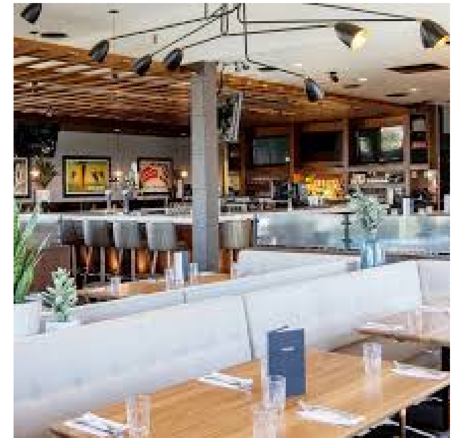
Earl's Kitchen + Bar 55 Bloor St W Unit 113