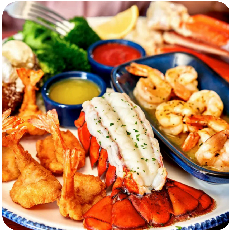
Red Lobster 1499 St. Laurent Blvd