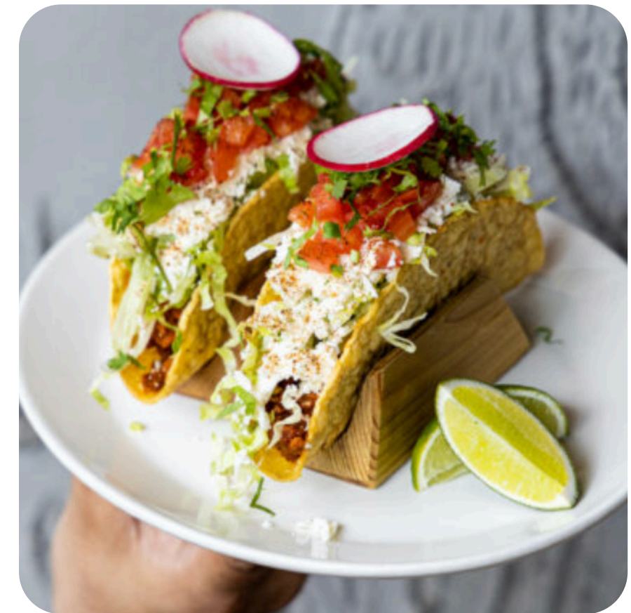
El Camino 380 Elgin St