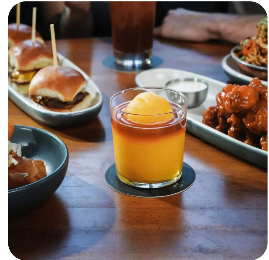
Joey's 825 Exhibition Way Unit 103