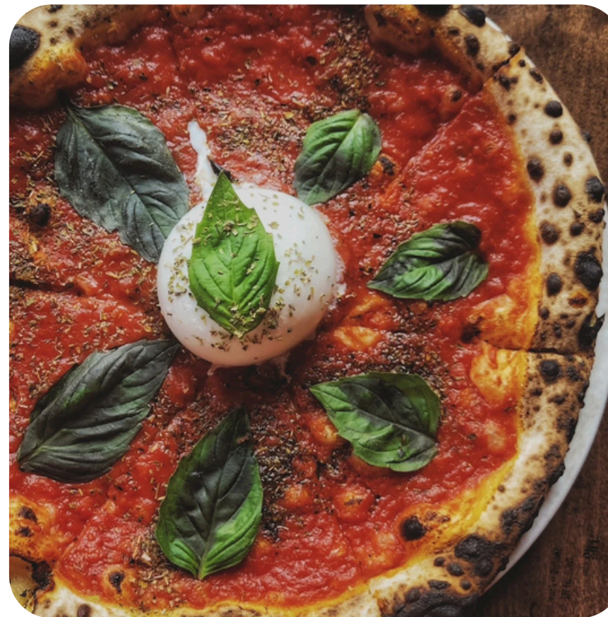
The Grand 74 George St