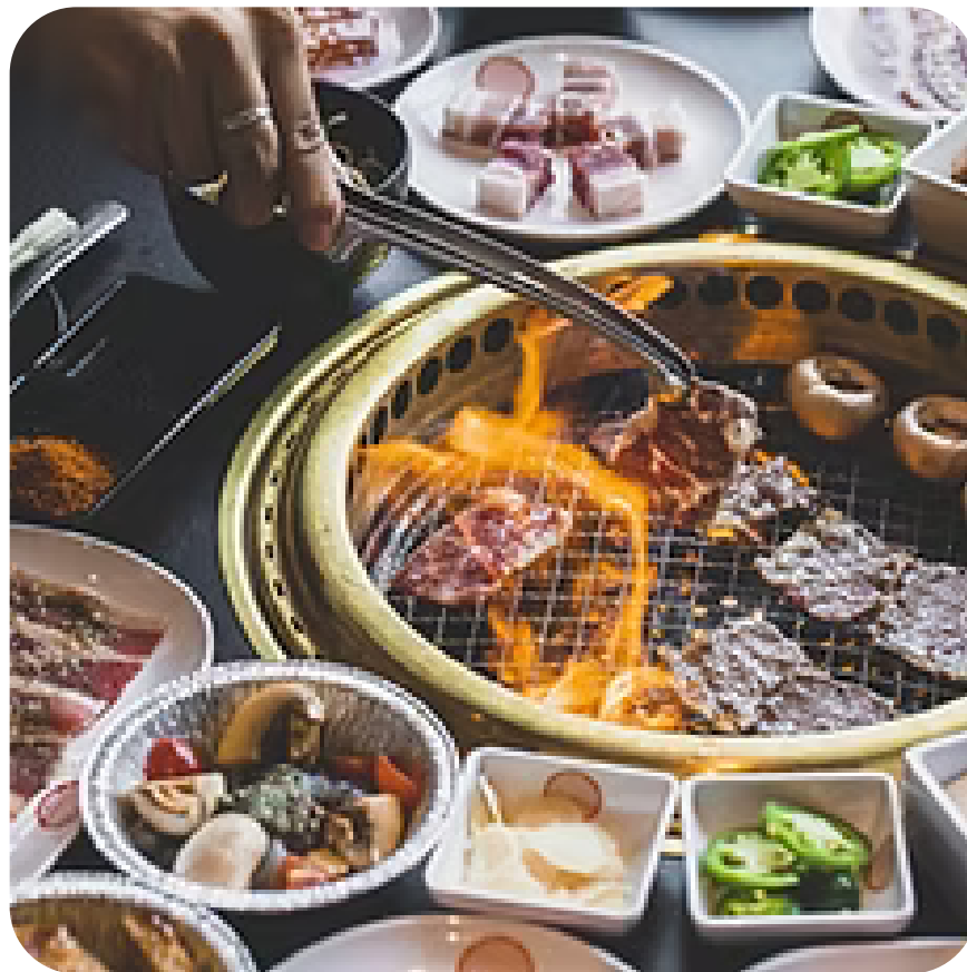
Gyubee Japanese Grill 95 York St